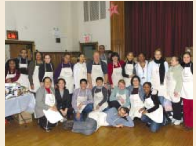
"Rusty" Staub and Catholic Charities staff take a break from distributing hundreds of holiday meals in Harlem

Catholic Charities is fortunate to have professional staff who "go the extra mile" as the norm.