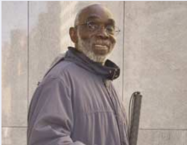
Visually challenged are helped by the Guild for the Blind