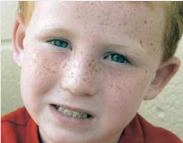
Youngster enjoying a break in summer camp activities

“CYO provides spiritual, athletic, cultural and recreational programs for youth”