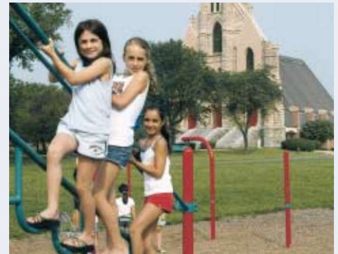
Children enjoy camp, MIV on Staten Island

“MIV at Mount Loretto and CYO are crafting a strategic plan to respond to new and growing needs on Staten Island”