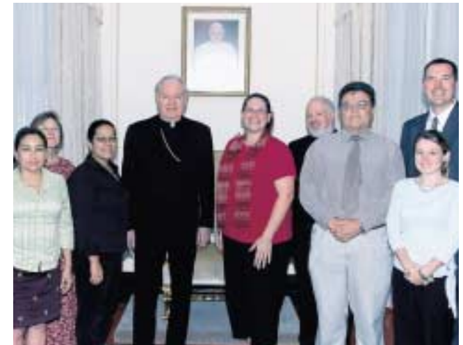
Cardinal Egan with the Catholic Charities team bound for Houston to help Katrina evacuees.

"...dedicated staff and volunteers practicing the virtue of charity about which our Holy Father spoke in his encyclical, Deus Caritas Est—God is Love."