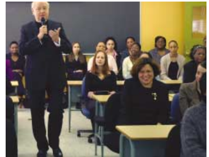
Cardinal Egan visits a class at Grace Institute

“For more than a century, Grace Institute has provided tuition-free, practical job training for underserved women...”