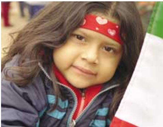
A young participant at an immigration rally

“Comprehensive and humane reform must foster the unification of families, curb illegal immigration,...and create an earned pathway toward citizenship.”