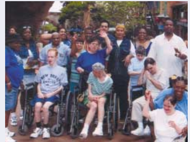
Developmentally disabled clients of Catholic Guardian Society stop for a group photo while enjoying a trip to a theme park.

“Catholic Guardian Society and Catholic Home Bureau merged into one of the largest child welfare agencies ...in New York.”