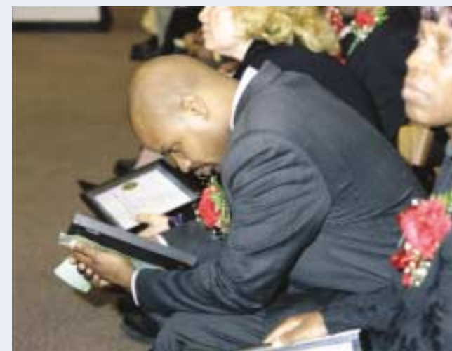
A graduate of the Educational Outreach Program, Social and Community Development

Respond to 75,000 hotline calls from teens and other individuals in crisis