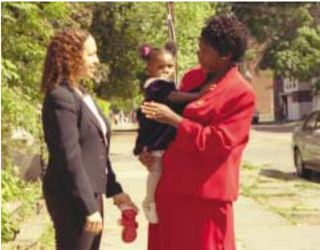
Providing help and creating hope in Newburgh

“Catholic Charities...of Orange County is committed to enhancing the vitality of human services”